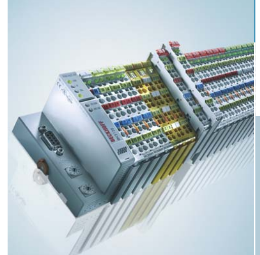
TwinSAFE: safety technology directly in the I/O system

PC Control on the DIN rail: Multivac has gone into large-scale production since the beginning of 2007 and has so far delivered approx. 1,500 packaging machines equipped with the CX1020 Embedded PC.